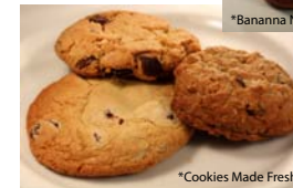
*Cookies Made Fresh!

House Made Pastries & Cookies: Ask about our gluten-free options!