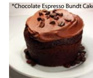
*Chocolate Espresso Bundt Cake