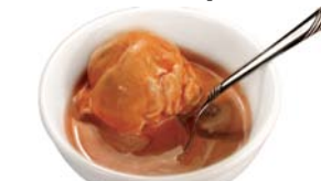
3. Mocha Affogato $2.75