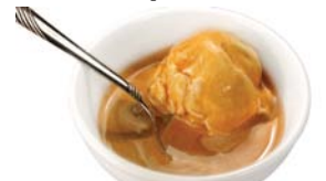
4. Espresso Affogato $2.75